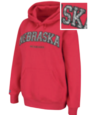
9B JANSPORT UNISEX ALPHA HOOD

Sewn applique zebra print graphics. Double needle coverstitched reinforced seaming, lined hood, and cotton knotted drawcord. 55% cotton, 45% polyester.