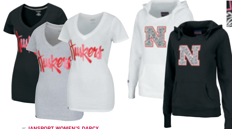
9C JANSPORT WOMEN'S DARCY SHORT SLEEVE TEE

XS | S | M | L | XL | 2XL $39.95 3XL $41.95