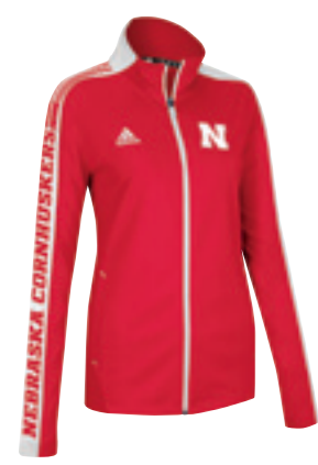
7A ADIDAS WOMEN'S SIDELINE WARM UP JACKET Knit, side pockets and contrast stitching. Woven, embroidered and screen printed graphics. 100% polyester. Red S | M | L | XL | 2XL $70.00