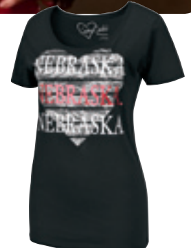
11C WOMEN'S CLAIRE SHORT SLEEVE TEE

Scoop neck. Screen-printed team name and foil heart graphics. 100% cotton.