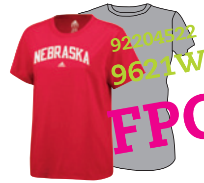
7I ADIDAS WOMEN'S FONTISM SHORT SLEEVE TEE Loose fit tee with arched screen print. 100% cotton. Red, Grey (Shown on Cover?) S | M | L | XL | 2XL $20.00