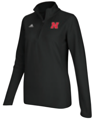
7G ADIDAS WOMEN'S 1/4 ZIP MICRO FLEECE ZIP 3 applied stripes on upper back. Embroidered logos. 100% polyester micro fleece. Black S | M | L | XL | 2XL $55.00