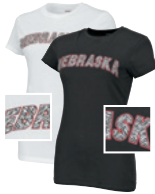
9A JANSPORT WOMEN'S SHORT SLEEVE TEE

Screen-printed zebra print graphics with contrast foil outline. 100% cotton jersey.