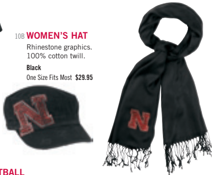
10B WOMEN'S HAT