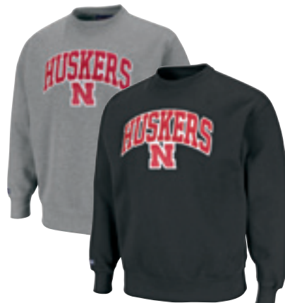
8G JANSPORT MEN'S UNDERGRAD CREW

Comfort twill applique. Brushed back fleece, spandex reinforced rib trims. 55% cotton, 45% polyester.