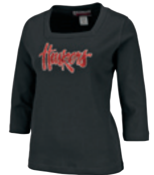
11F WOMEN'S 3/4 SLEEVE TEE

Rhinestone graphics. 100% combed cotton.