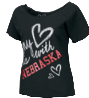
11B WOMEN'S KAYLEE SHORT SLEEVE TEE

Open neck. Screen-printed and foil graphics. Lightweight, 100% french terry fleece.