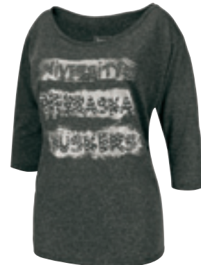
10E WOMEN'S ALEXA 3/4 SLEEVE TEE

Scoop neck. Gunmetal foil graphics with dome head studs. Super soft, 84% cotton, 16% linen.