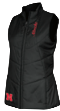
7H ADIDAS WOMEN'S QUILTED VEST All over quilted pattern. Front pockets. 3 self fabric stripes on upper back. Embroidered graphics. 100% polyester. Black S | M | L | XL | 2XL $55.00