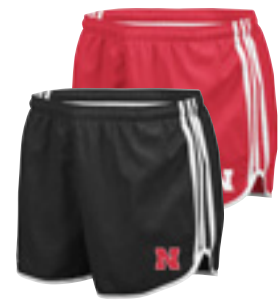
7E ADIDAS WOMEN'S PRINCESS MESH SHORT 3 self fabric stripes on sides. 3" inseam. Embroidered logos. 100% polyester mesh. Black/White, Red/White S | M | L | XL | 2XL $30.00