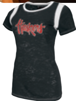
10A WOMEN'S BURNOUT FOOTBALL SHORT SLEEVE TEE

Rhinestone graphics. 50% polyester, 50% cotton.