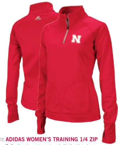
7C ADIDAS WOMEN'S TRAINING 1/4 ZIP Reflective zipper tape at neck. Vertical tonal 3 stripes on cuff. Reflective Adidas logo at back neck. Embroidered school logo. 100% polyester fleece. Red (Shown on Model) S | M | L | XL | 2XL $50.00