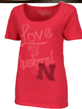
11A WOMEN'S AYDEN SHORT SLEEVE TEE

Scoop neck. Pressed glitter 'N' with screen printed graphics. 100% cotton.