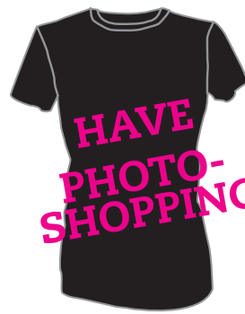
11D WOMEN'S LYDIA SHORT SLEEVE TEE

Scoop neck. Screen-printed and foil graphics. 100% cotton.