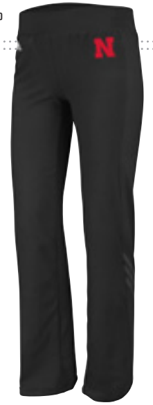
7F ADIDAS WOMEN'S TRAINING PANT 3 tonal stripes across mid calf on both legs, screen-printed logo at hip. 85% polyester, 15% spandex. Black S | M | L | XL | 2XL $50.00