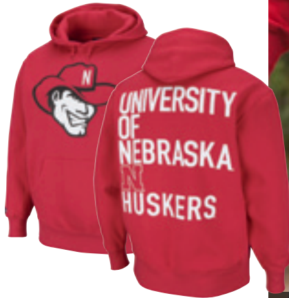
8C JANSPORT MEN'S OMEGA FULL ZIP HOOD

Screen-printed graphics. Dyed to match zipper front and pouch pocket. Fully lined hood, antique brass logo grommets and cotton knotted drawcord. 55% cotton, 45% polyester.