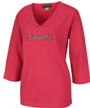
10D WOMEN'S LONG SLEEVE TEE

Rhinestone graphics. 100% combed cotton.