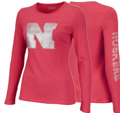
11E WOMEN'S TAYLOR LONG SLEEVE TEE

Rhinestone encrusted 'N' on front, "Huskers" in foil and rhinestone sparkle down the sleeve. 95% cotton, 5% spandex.