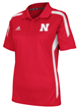
7D ADIDAS WOMEN'S SIDELINE POLO Climalite. Front and back mesh inserts. Contrast back stitching and embroidered logos. 100% polyester. Red S | M | L | XL | 2XL $55.00