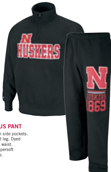
8F JANSPORT MEN'S CAMPUS PANT

Screen-printed graphics. On-seam side pockets. Roomy fit throughout the seat and leg. Dyed to match cotton drawcord, elastic waist. 32" inseam-size Large. Comfy supersoft 55% cotton, 45% polyester fleece.