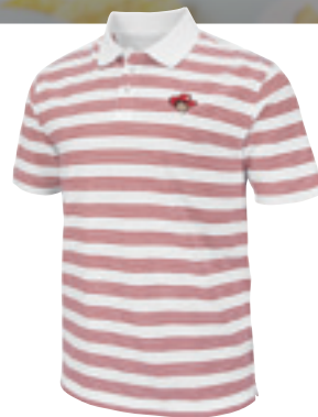
16D CUTTER & BUCK MEN'S POLO

Charcoal Heather, Black S | M | L | XL | 2XL $84.95 3XL $89.95