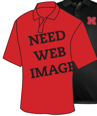
18A ADIDAS GOLF MEN'S CLIMALITE SOLID POLO Rib knit collar open sleeve hem. Screen-printed graphics. 100% polyester. Black, Red S | M | L | XL | 2XL $55.00