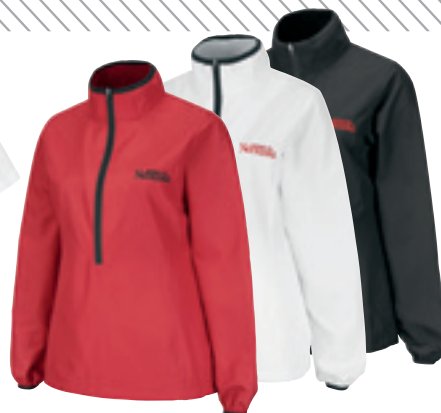
18A CUTTER & BUCK WOMEN'S 1/2 ZIP WeatherTec post-game half-zip with funnel-neck styling. Princess seams. Drawcord hem. Contrast binding at sleeve. Wind and water resistant. On seam pockets. Packable into it's own pocket. 100% polyester. Black, Red, White S | M | L | XL | 2XL | 3XL $64.95