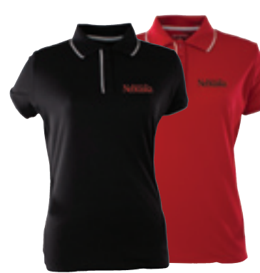
17D ANTIGUA WOMEN'S ELITE POLO

Dark Red/Grey/White S | M | L | XL | 2XL $45.95