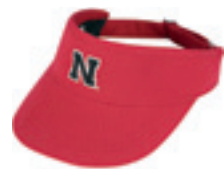
18A MEN'S STRETCH FIT CAP Low profile, stretch fit, GX performance, contrast inset panels, 3D embroidery on front. Red, Black one size fits most $19.95