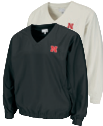
18A CUTTER & BUCK MEN'S WINDSHIRT Windtex Asture V-neck Windshirt. Elastic hem. Fully lined. Breathable. Light weight. Wind resistant. Front pockets with zippers. Embroidered graphic on chest. Black, Blanc S | M | L | XL | 2XL $74.95 3XL $79.95