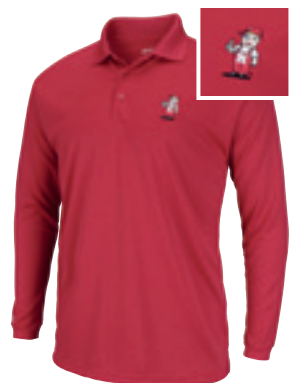
16E ANTIGUA MEN'S LONG SLEEVE POLO

White, Black XS | S | M | L | XL | 2XL | 3XL $39.95