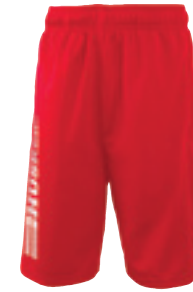
21A ADIDAS YOUTH CLIMALITE SHORTS 100% polyester Climalite Interlock Screen Print & heat transfer. Red S | M | L | XL $25.00