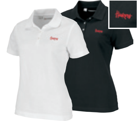
17C CUTTER & BUCK WOMEN'S 3/4 SLEEVE POLO

Cardinal Red, White, Black XS | S | M | L | XL | 2XL | 3XL $64.95