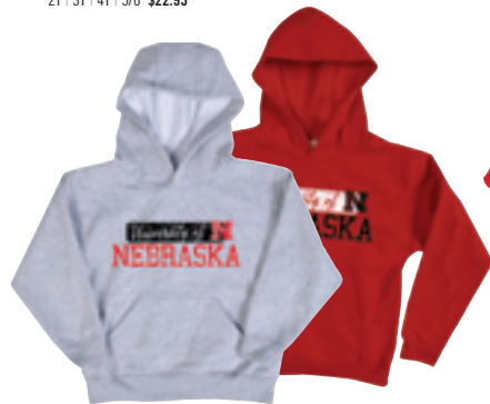
20A TODDLER HOOD 80/20 COTTON Hoody with vintage-looking screen-printed school name. 80% cotton, 20% polyester. Oxford Grey, Red 2T | 3T | 4T | 5/6 $29.95