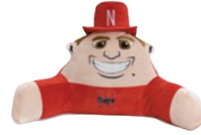
21A "LOUNGIMAL" This is an item geared more towards a toddler and the older children. Something that can be used in a fan cave or a child's bedroom and just offers comfort while watching their favorite team on tv. Made of 100% polyester, soft and creates the fan image inside the home. $49.95