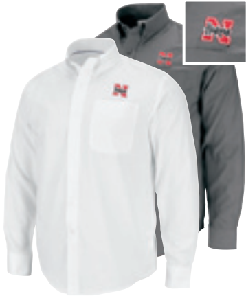
16A CUTTER & BUCK MEN'S LONG SLEEVE BUTTON DOWN

Button-down collar. Front placket. Barrel cuff. Double back pleat. Wrinkle resistant finish. Embroidered graphic on chest. 60% cotton, 40% polyester.