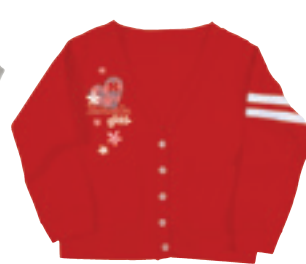
20A TODDLER CARDIGAN 100% cotton interlock. Red 2T | 3T | 4T | 5/6 $34.95