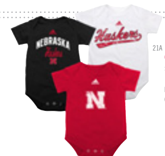
21A INFANT CREEPER SET Screen-printed graphics. 100% cotton jersey. Black, Red, White 0-3 | 3-6 | 6-9 $30