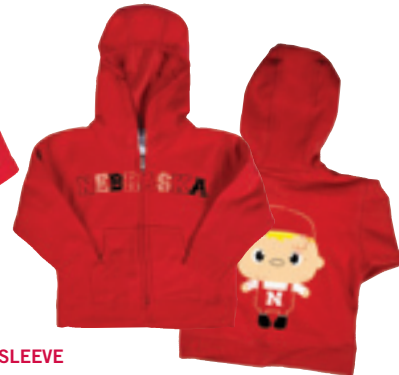
20A TODDLER HOOD Zip up hoody with screen-printed school name graphic and front pockets. 80% cotton, 20% polyester. Red 2T | 3T | 4T | 5/6 $34.95