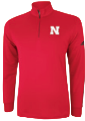
18A ADIDAS GOLF MEN'S CLIMALITE WARM LAYERING PULLOVER TOP Screen-printed graphics. 95% polyester 5% lycra. University Red/Black S | M | L | XL | 2XL $70.00