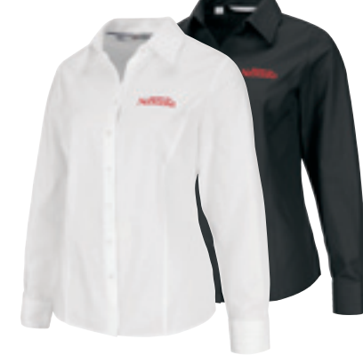
17F CUTTER & BUCK WOMEN'S LONG SLEEVE BUTTON DOWN

Epic Easy Care Fine Twill, princess seams. Pin tucking on collar and cuffs. Wrinkle resistant finish. Embroidered graphic on chest. 60% cotton, 40% polyester.