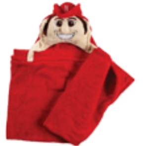
21A HUGGABLE BLANKET WITH HOOD This blanket makes the mascot really come to life for that little fan. The hood provides more comfort and warmth and has a velcro strip to keep the hood secured and little hand pockets to ensure being able to them themselves up at night. $32.95