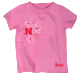
20A TODDLER SHORT SLEEVE TEE 100% cotton. Red 7 | 8/10 | 10/12 | 14/16 $24.95