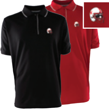
16F ANTIGUA MEN'S SHORT SLEEVE POLO

Moisture management pique short sleeve with 3-button placket. Contrast piping detail at placket, tipped flat knit collar and cuffs. Embroidered graphic on chest. 100% polyester desert dry xtra lite.