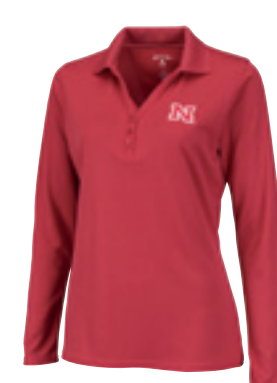
17E ANTIGUA WOMEN'S LONG SLEEVE POLO

Dark Red/White, Black/White S | M | L | XL | 2XL $49.95