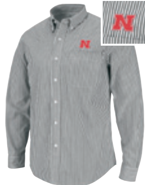
16B CUTTER & BUCK MEN'S LONG SLEEVE BUTTON DOWN

Black, White, Cardinal Red (Shown on Model) XS | S | M | L | XL | 2XL | 3XL $79.95