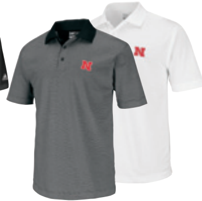
18A CUTTER & BUCK MEN'S POLO Double faced novelty collar. 3 button placket. Back half moon side vents. Open sleeve. Dyed to match logo buttons. Screen-printed graphics. 74% pima cotton, 26% micro polyester interlock jersey. Black, White S | M | L | XL | 2XL $54.95 3XL $59.95