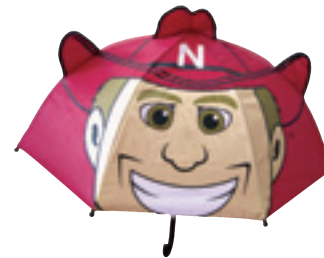
21A MASCOT UMBRELLA The umbrella is 100% nylon and perfect for any kids between the ages of 3-10. This item has a cuteness appeal with the 3-D mascot face and ears and also really provides for a logical purpose during spring showers. $19.95