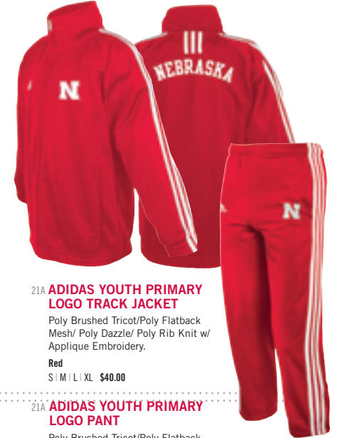
21A ADIDAS YOUTH PRIMARY LOGO TRACK JACKET Poly Brushed Tricot/Poly Flatback Mesh/ Poly Dazzle/ Poly Rib Knit w/ Applique Embroidery. Red S | M | L | XL $40.00 21A ADIDAS YOUTH PRIMARY LOGO PANT Poly Brushed Tricot/Poly Flatback Mesh/ Poly Dazzle with screen-printed logos. Red S | M | L | XL $35.00