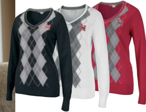
17A CUTTER & BUCK WOMEN'S V-NECK SWEATER

Match point v-neck, tubular finish at neck. T-neck styling english shoulder. Color blocking on front, 1x1 rib, 12 gauge, Fully fashioned construction. Jersey stitch. Linked seams. Embroidered graphic on chest. 100% combed cotton.