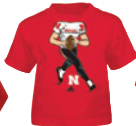
20A INFANT/TODDLER SHORT SLEEVE FOOTBALL PLAYER TEE TBD. Red Infant | 2T | 3T | 4T $15.00