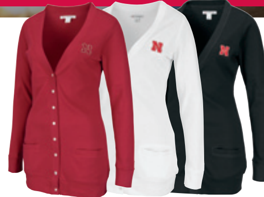
17B CUTTER & BUCK WOMEN'S CUFFED SLEEVE CARDIGAN

White/Cardinal Red Stripe (Shown on Model) S | M | L | XL | 2XL $49.95 3XL $54.95