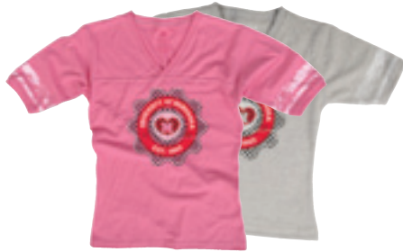
20A TODDLER SHORT SLEEVE TEE Screen-printed seal, school name, and est. date. 100% cotton Varsity Grey, Pink 2T | 3T | 4T | 5/6 $22.95