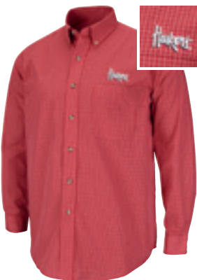
16G ANTIGUA MEN'S LONG SLEEVE BUTTON DOWN DRESS SHIRT

Dark Red/White, Black/White S | M | L | XL | 2XL $49.95