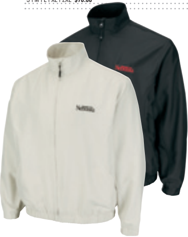
18A CUTTER & BUCK MEN'S FULL ZIP WINDSHIRT Full zip seaming detail. Full elastic hem. Partial elastic cuff. Fully lined. Logo zipper pull. Embroidered graphic on chest. 100% polyester twill. Blanc, Black S | M | L | XL | 2XL $74.95 3XL $79.95