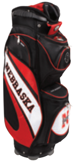
19F COOLER BAG Rugged 840D nailhead nylon construction provides durability and protection from wear. Its 9 front-facing zippered pockets, including a velour-lined valuables pocket with a waterproof zipper, provide storage all your gear. A 9" top with individual full-length dividers for club organization. Other features include: beverage pocket, putter tube, removable rain hood, umbrella holder, towel ring and padded shoulder strap. $199.95