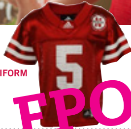
20A TODDLER REPLICIA JERSEY TBD. Red 2T | 3T | 4T $35.00