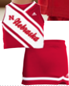
20A TODDLER 2 PIECE CHEERLEADING UNIFORM TBD. Red 2T | 3T | 4T $34.00