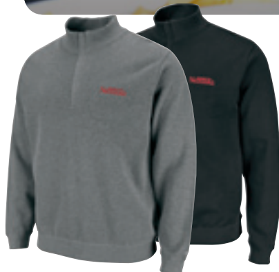
16C CUTTER & BUCK MEN'S HALF ZIP SWEATER

Black/White Stripe S | M | L | XL | 2XL $69.95 3XL $74.95