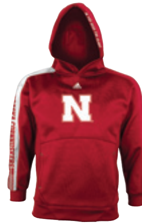
21A ADIDAS YOUTH SIDELINE SWAGGER HOOD Poly Fleece w/ Applique Embroidery & Screen Print. Red S | M | L | XL $45.00